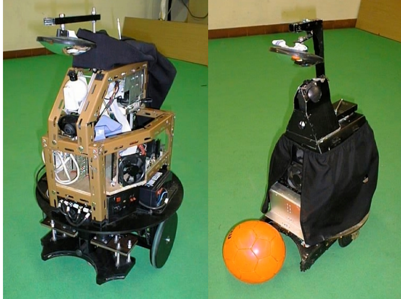
Fig. 1. Robots from MINHO team (new robot on the left, old robot on the right)

The old robots are still in use as testing platforms and are able to play football. Their description can be read in [1] and [2].